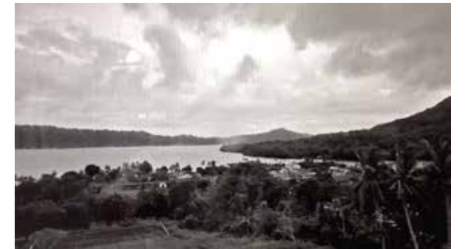
Banda Neira, 2017 Video still