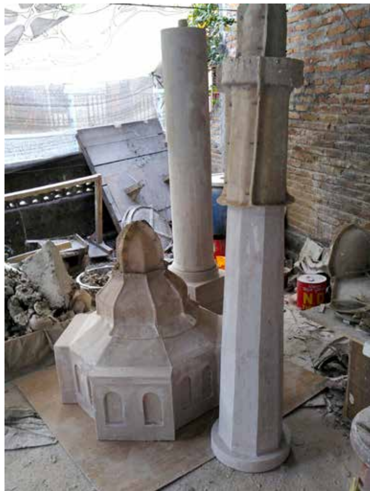
Monuments, 2017 In progress / Wax moulds