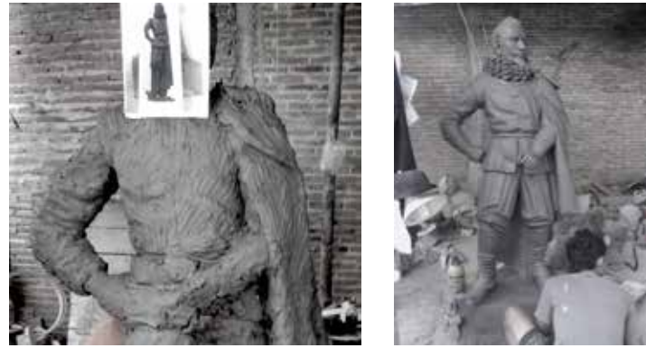
Coen wax sculpture, 2017 In progress / Clay

DAMN°: For your exhibition at the Oude Kerk, you have worked a lot around the history of Indonesia and the iconography of Dutch colonialism. Is that something that has always featured in your practice or is it specific to this show?