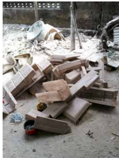
Monuments, 2017 In progress / Moulds

IH: On the left side of the coach, there is a triptych painted by artist Nicolaas van der Waay called Homage from the Colonies. In the middle is the Queen on a throne. To her right are people from the African colonies; to her left are Indonesians. They are all bringing offerings to the Queen. I think the symbolism is fascinating. You could say it is 'heritage'. But it's surprising to see that with all those colonial symbols, the coach is still used in the present day to carry the Royal Family. I basically recreated the paintings by only using the contours, which I formed from steel rods to create the image.