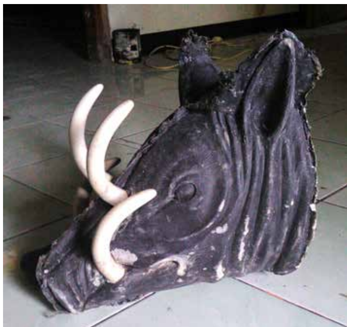
Trophy: Babiroussa head, 2017 Rubber and FRP