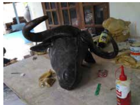
Trophy: Bull head, 2017 Rubber

DAMN°: What about the third body of work you are going to show?