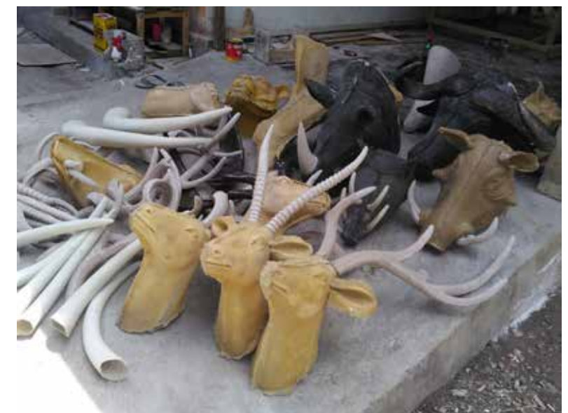
Trophy, 2017 Production preview / Rubber and FRP